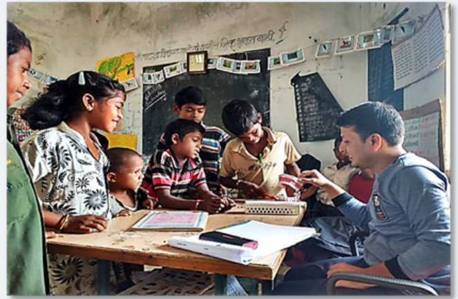
Dental check up with personal counselling

LBP's School Health Awareness Programme (SHAPE) focuses on awareness of students and teachers about adolescent health, sex education, hygiene, menstrual health and addictions. For most of the Madia families it is their first generation who are attending the formal schools. Doctors from LBP conduct this programme. They guide about personal hygiene and good touch-bad touch to the students of 1st to 5th standard. For the students of 6th to 12th standard, focus is on adolescent health education and sex education. It covers the scientific information about physical and mental changes in adolescents, human reproductive system, menstruation, nightfall, sexual reproduction, hazards of consanguineous marriages and early pregnancy, masturbation, difference between love and attraction, sexually transmitted diseases, methods of contraception etc. Thorough oral health screening is done by dentist from our hospital along with personal counselling of students.