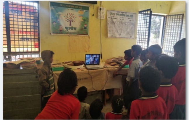
Kids watching health education video in Madia

Complete health & hygiene check-up is conducted & nail cutting is done to demonstrate kids how to maintain it at their home. Different tools of health education like videos, power point presentation, games, competition, Madia short films, questionnaire, group discussions, puppet show, etc. are used in this programme. 27 remote tribal schools in Bhamragad were covered in 33 camps under School Health Awareness Programme (SHAPE) in academic year 2022-23. Health check-up of Total 1858 students were done individually.