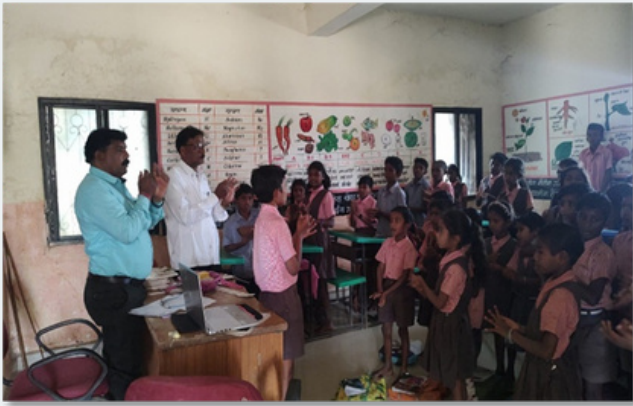
Hand washing demonstration by school kids & teachers