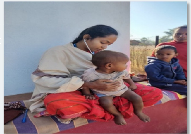
New borne follow up at Pengunda village