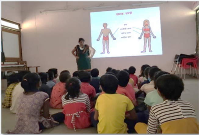
Age appropriate sex education activity

'Knowledge is the best pill & best vaccine' therefore Health education is important for improving health status of people in the tribal region like Bhamragad. Tribal Ashram schools & ZP Schools at villages provides a platform to give proper health education & helps to achieve generational changes for the community.