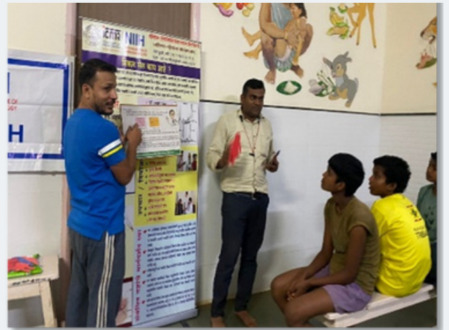
Awareness session of ashram school students