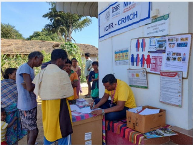
Village screening camp at Pengunda village