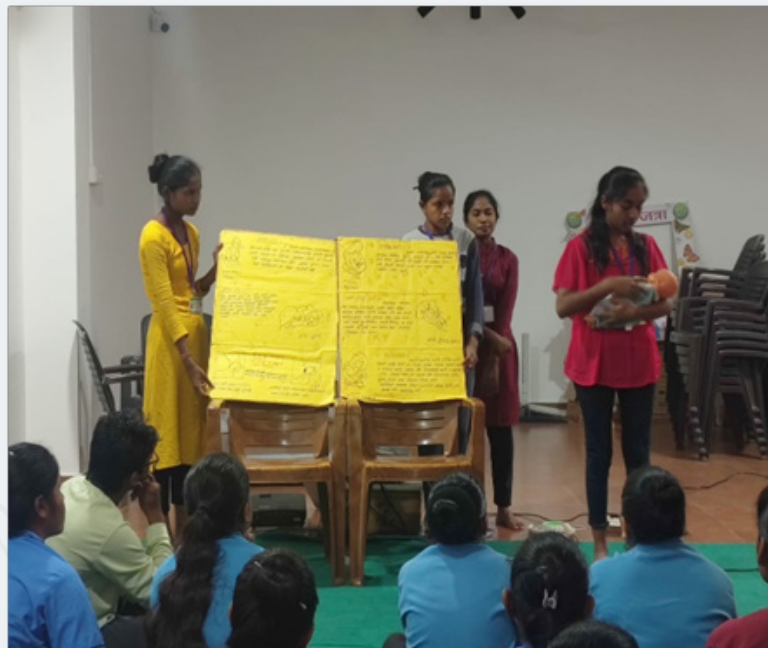
Nursing students explaining about proper methods of breastfeeding .

Lok Biradari Prakash Hospital, Hemalkasa organized a Breast-feeding Awareness competition for hospital staff and student nurses with objective of improving and refreshing their knowledge about the breastfeeding which will make them capable for educating mothers along with their families about breastfeeding effectively. Staff were asked to choose topic of their interest regarding Breastfeeding, get information about it and were given option of presenting it in any way like power point presentation, poster making, short film, small roleplay, storytelling, etc.