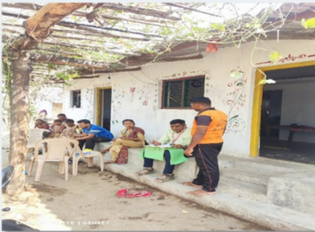
age for w up at